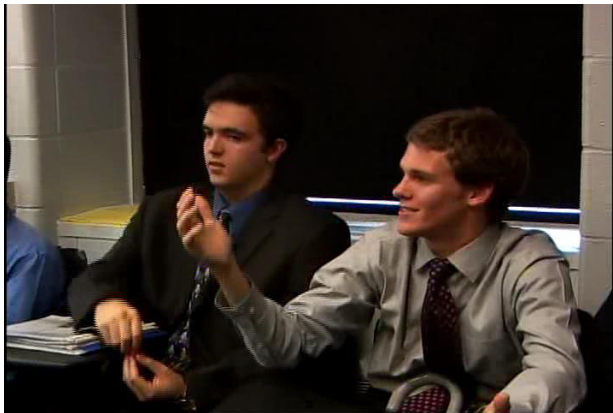
Figures 5-7: Camera shots when presentation slides are not present: (top left) Prototype demonstration, (top right) Q&A from students, (bottom left) Q&A from audience member.

Key frames are an invaluable visual tool for an alternative to viewing the entire video or using the positioning peg to skim a video. Analog to a full video player, we also include a key frame player, which plays back the video as a slide show. In user studies we have observed that this player is favored over the full video player when students are searching or browsing. Nonetheless, it does not replace a full video player for in-depth analysis of a student performance.