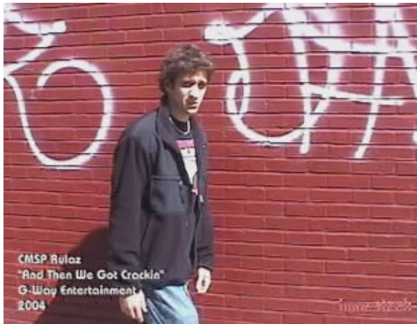
Figure 8: Journal summary video in the form of a rap music video. While highly creative and entertaining, the video lacks work on the course project.