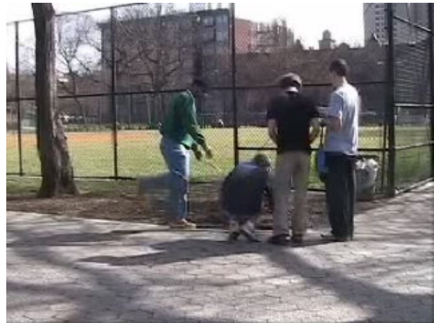
Figure 9: Journal summary video showing work in the “field”. Inclusion of shots showing a project site or other project-relevant material helps to convey the problem and goals.